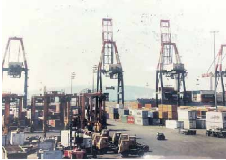
Trans-shipment Port 2.