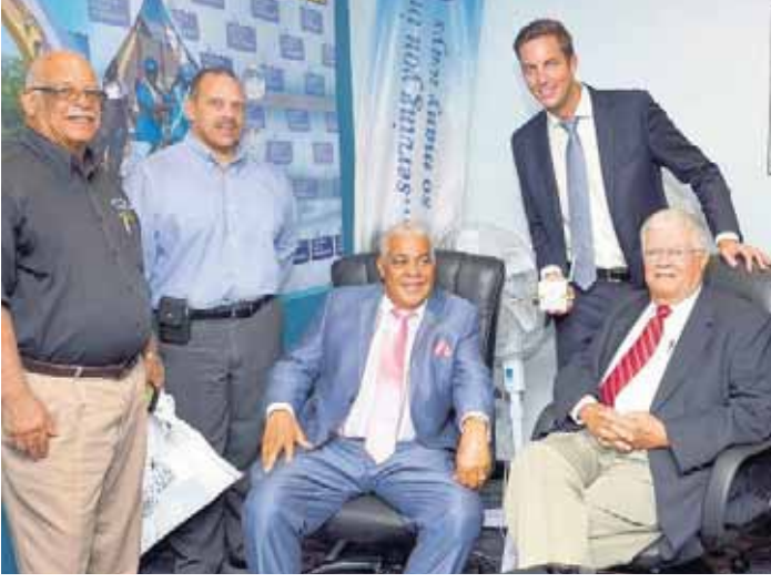
DIEHL Metering partnership.