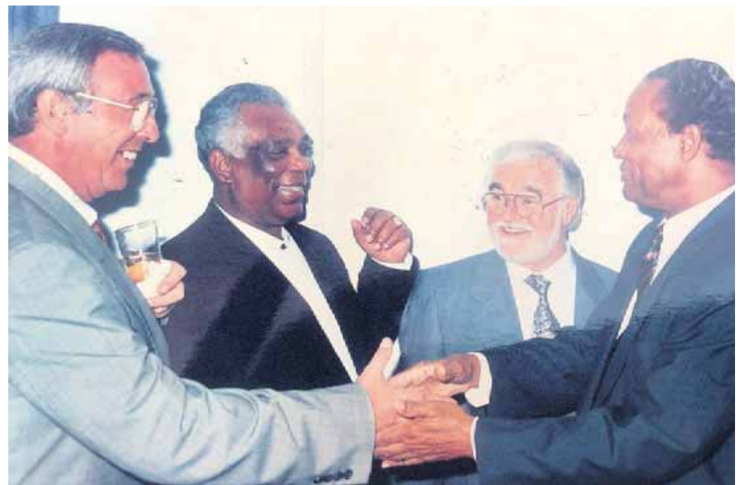
Special plaque presentation by Kalmar.