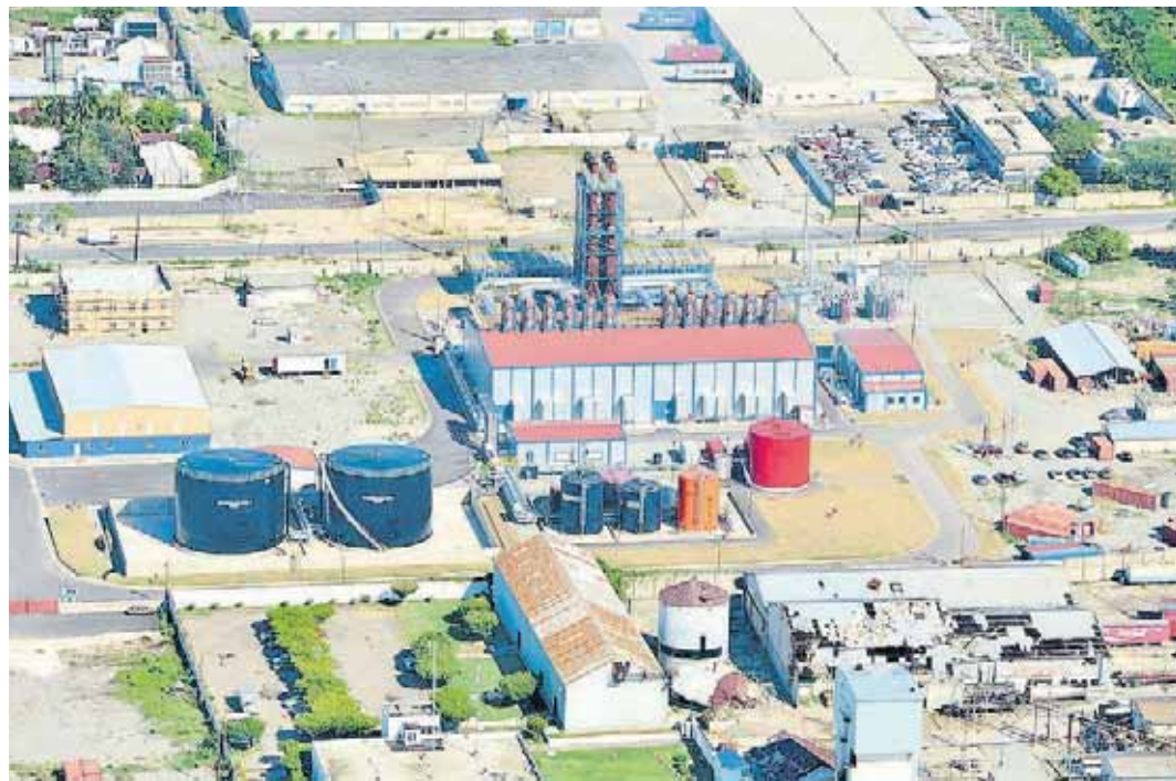
Wartsila JEP 66MW Plant, west Kingston.