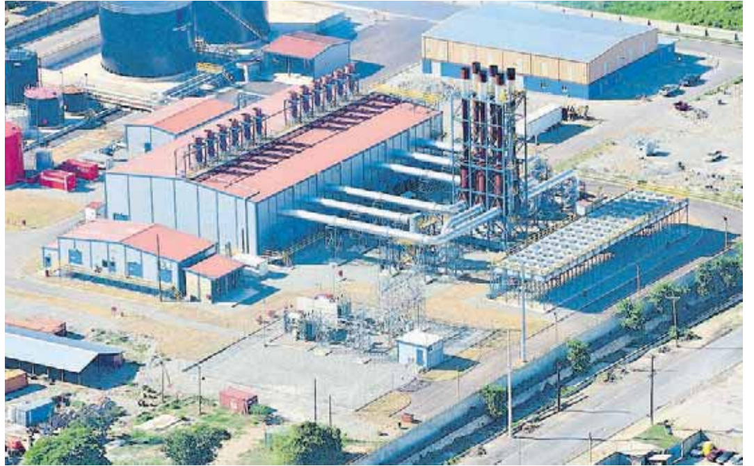
Wartsila JEP 66MW Plant, west Kingston.