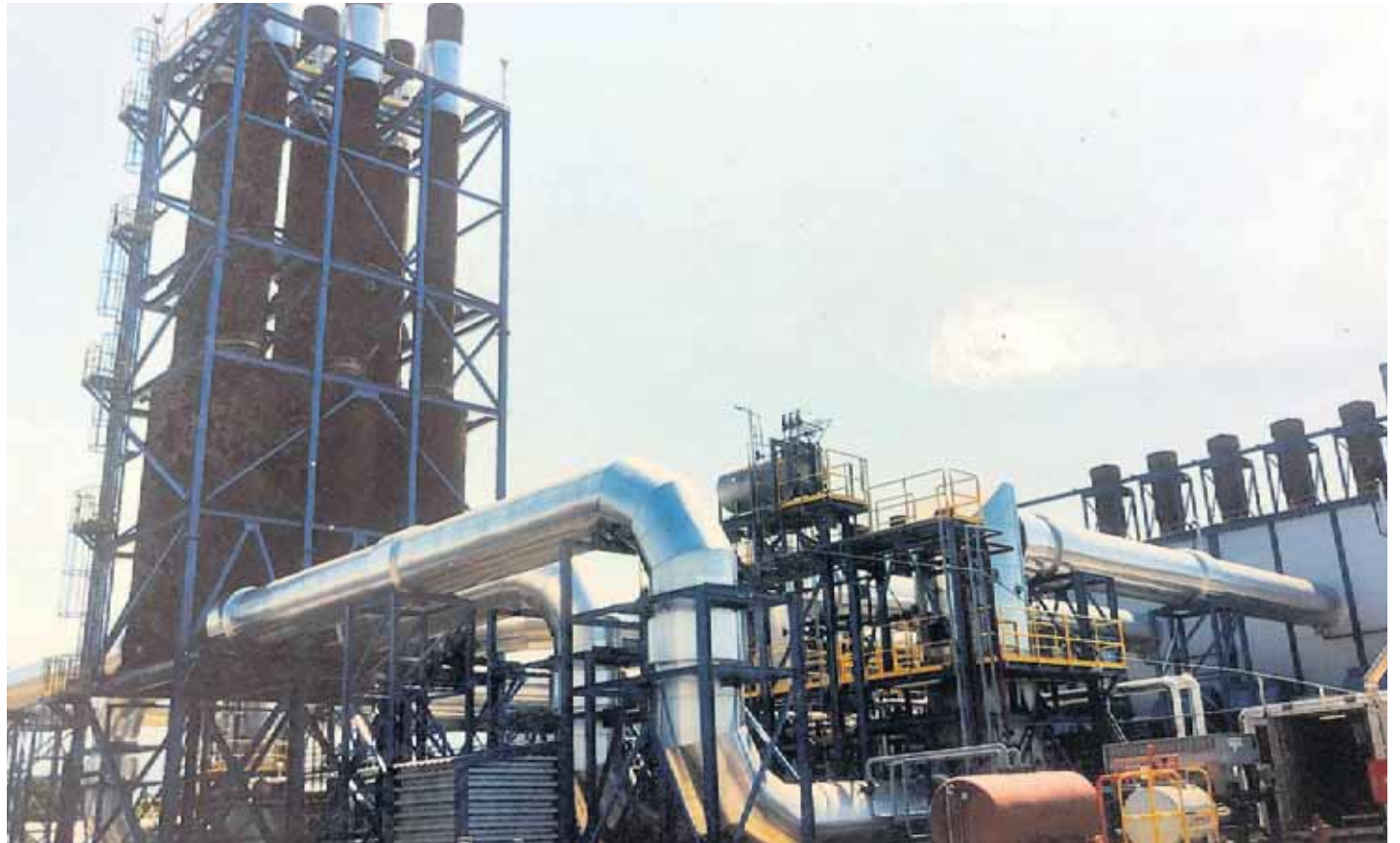
West Kingston Power Plant.