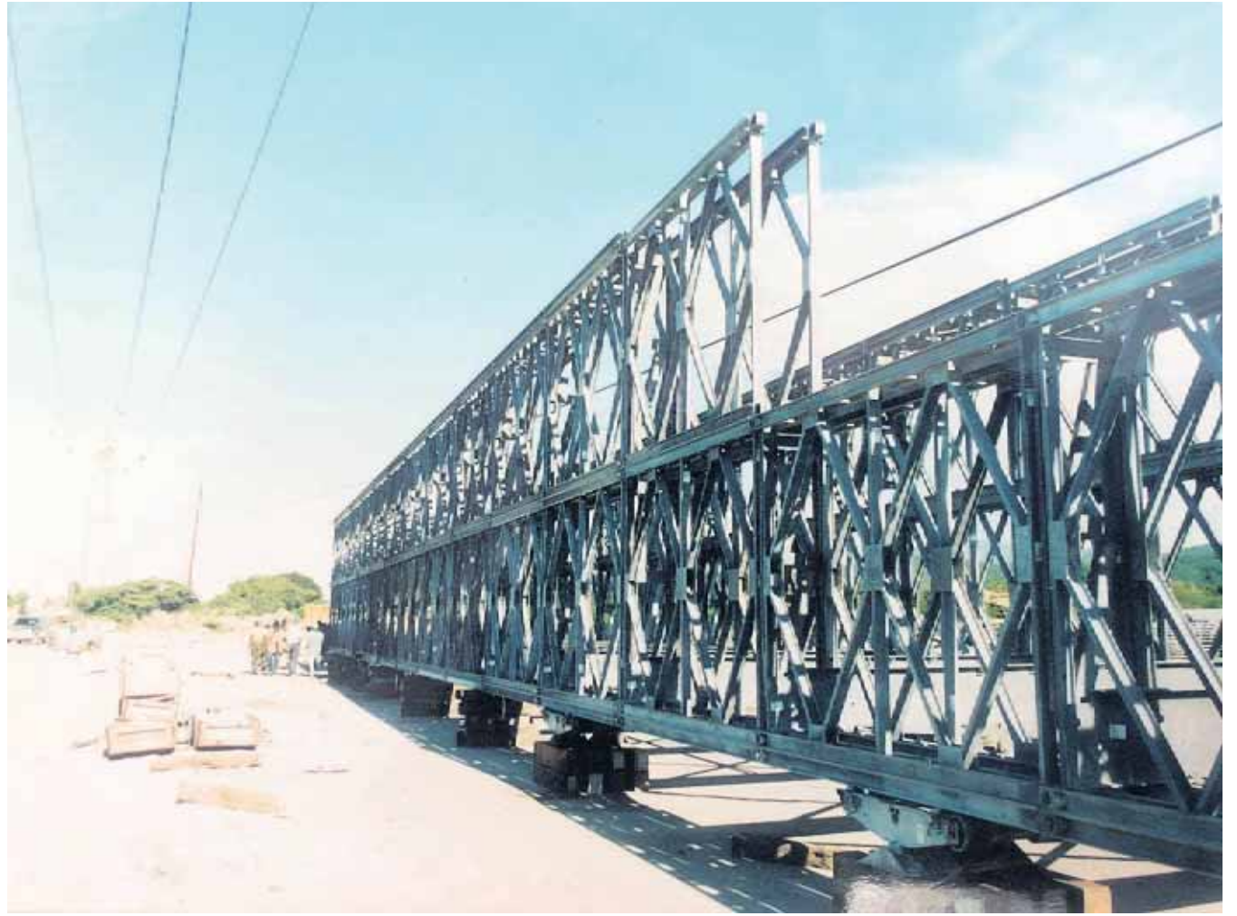
Yallahs River Bridge.