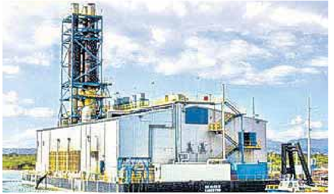
Jamaica Energy Partners.