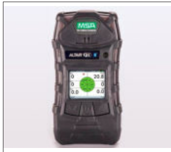
Portable Gas Protector