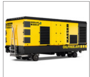
10 HP Kaeser Mobilair M500-2 Portable Oil Free Air Compressor