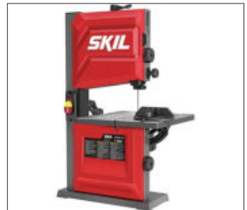
Benchtop Band Saw