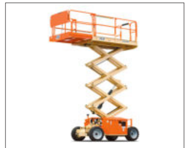
Electric Scissor Lift