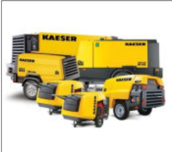
Portable Diesel Air Compressors