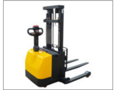
Mobile Reach Stacker