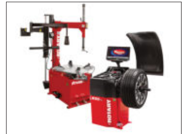
Combo Kit R146R Tyre Changer and Wheel Balancer R155