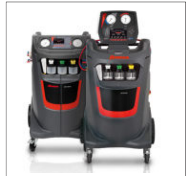
Air Conditioning Equipment