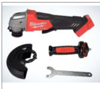
Milwaukee Cordless Angle Grinder