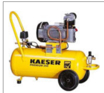
Kaeser Premium 250/24W Workshop Compressed Air Piston Compressor