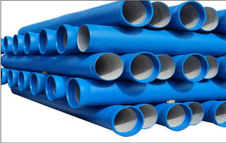
Ductile Iron Pipes

We are your trusted supplier for all major ductile iron pipes and fittings requirements. Our pipes offer superior tensile strength to withstand heavy loads and high-pressure environments. From water supply systems to wastewater treatment plants, our pipes are suitable for various industries and irrigation needs.