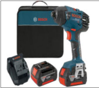
Bosch 18V Drill/Driver Kit

Discover your business potential with our extensive range of power and speciality tools. From drills and saws to wrenches and fastening devices, our tools offer unparalleled performance and durability. Designed to meet the unique needs of various industries, our equipment enables you to work with precision, efficiency, and safety.