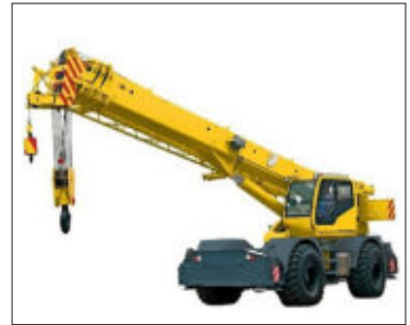
Hydraulic Mobile Crane