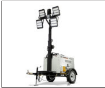
Mobile Light Tower