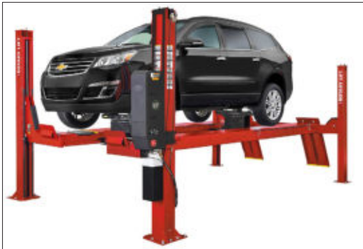
Four Post Lift – ARO14 | Open Front Alignment Rack Capacity: 14,000lbs.