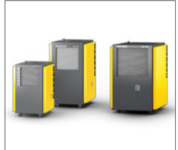
SECOTEC Refrigerant Dryer