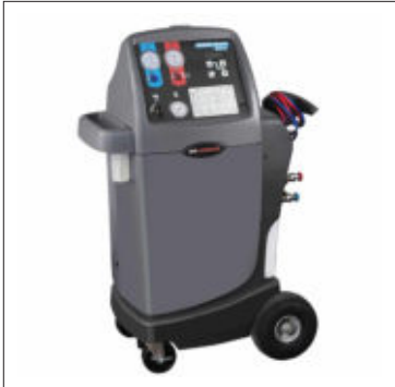
Refrigerant Recovery Machine