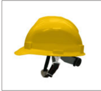
Heavy Duty Helmet