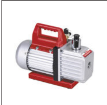
VacuMaster Economy Vacuum Pump