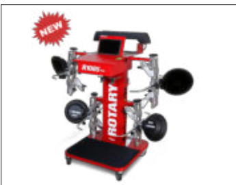
Wheel Alignment R1085