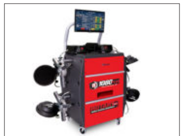
Rotary R1080 3D Wheel Alignment System