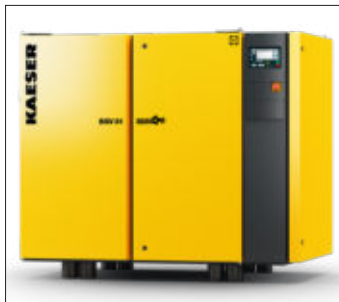
Rotary Screw Vacuum