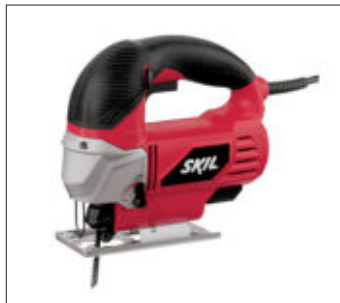
5.5 Amp Orbital Action Jigsaw