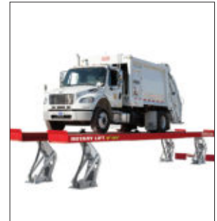
Scissor Lift – V-REX Heavy Duty Vertical Rise Lift Capacity: 44,000 – 80,000 lbs