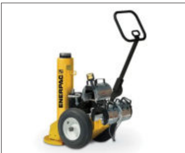
Enerpac POW'R Riser Lifting Jack