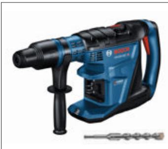
Bosch Profactor 18v Rotary Hammer