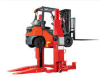
Forklift Ramp Kit M140004RD used with MCH418