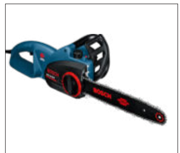
Bosch GKE 35 BCE Chainsaw, 2100 W