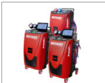
New Line of Fully-Automatic A/C Solutions R3AC50-A R3AC60-YF R3AC80-AYF