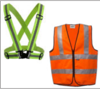
Elastic Strap and Vest

Ensuring safety remains our top focus. We provide a wide range of safety equipment to safeguard your workforce, including helmets, gloves, safety glasses, and more. Our premium safety gear helps establish a secure work setting, minimizing accidents and fostering a safety-conscious atmosphere.