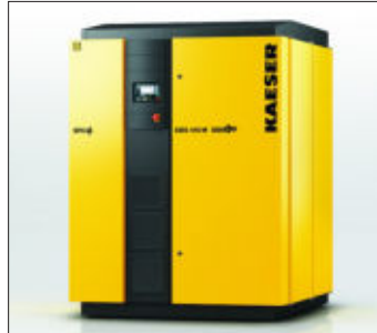
Rotary Screw Blowers