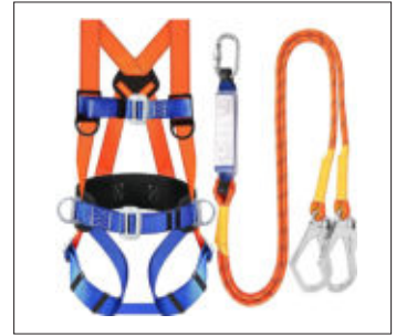
Harness Fall Protection