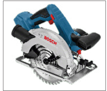
Cordless Circular Saw