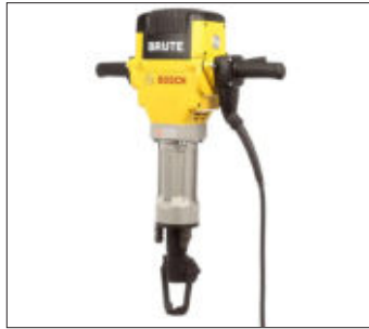
Bosch 120 Volt/15 Amp Corded Breaker Hammer