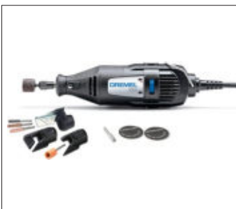
Dremel 100 Single Speed Rotary