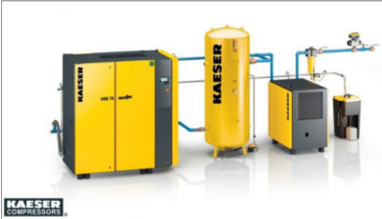
Air Compressed Distribution System